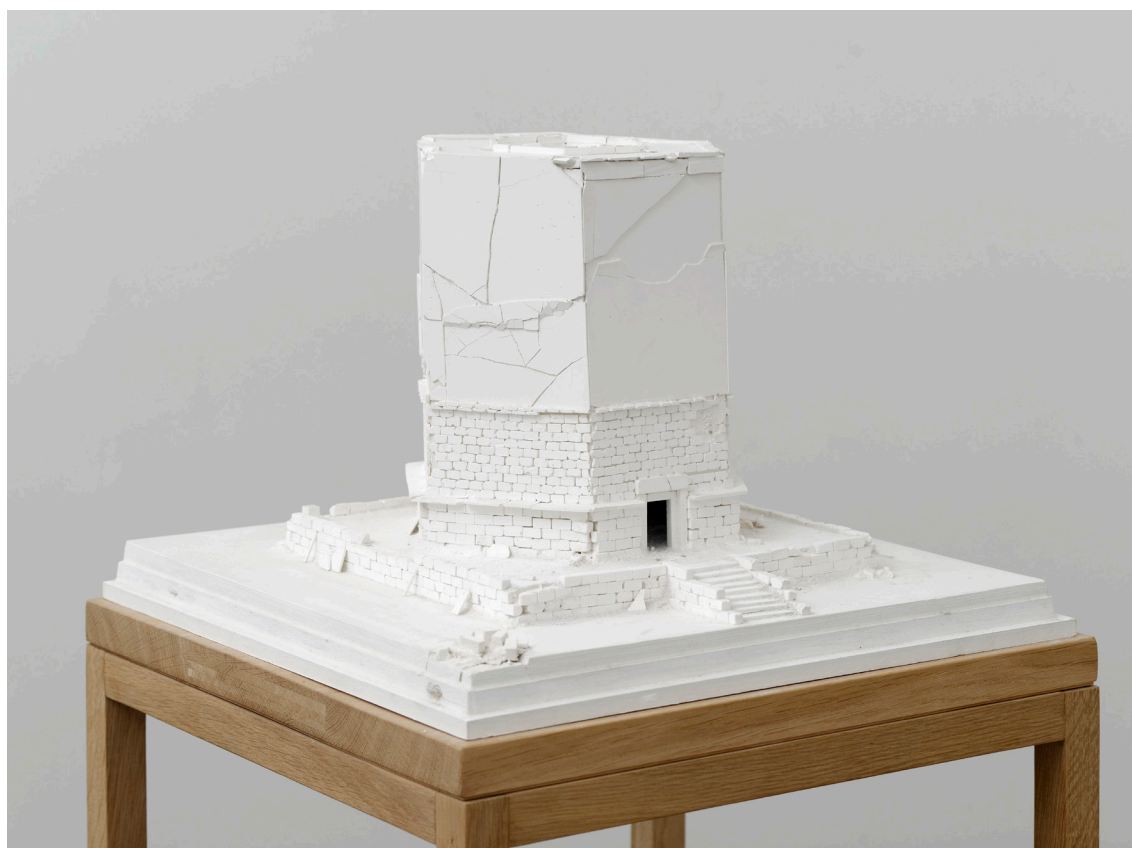
Lost Archetypes, 1979 © Anne et Patrick Poirier, Courtesy Galerie Mitterrand. Photo: Aurélien Mole

Four plaster architectural works, titled Lost Archetypes confirm the duo's passion for architecture. «These pieces are part of a series of utopic works. The very first ones were inspired by the site of Villa Adriana, a solar site erected by emperor-architect Hadrian between 118-138 AD. These different works were constructed in the style of geometrical archetypes: the square, circle, cylinder, triangle and pyramid. Together they make up the model of a utopia whose original map is now lost. We may have found them in the room of lost archetypes during our excavations undertaken in our Mnémosyne . But time and oversight had already begun their work of attrition and destruction.»