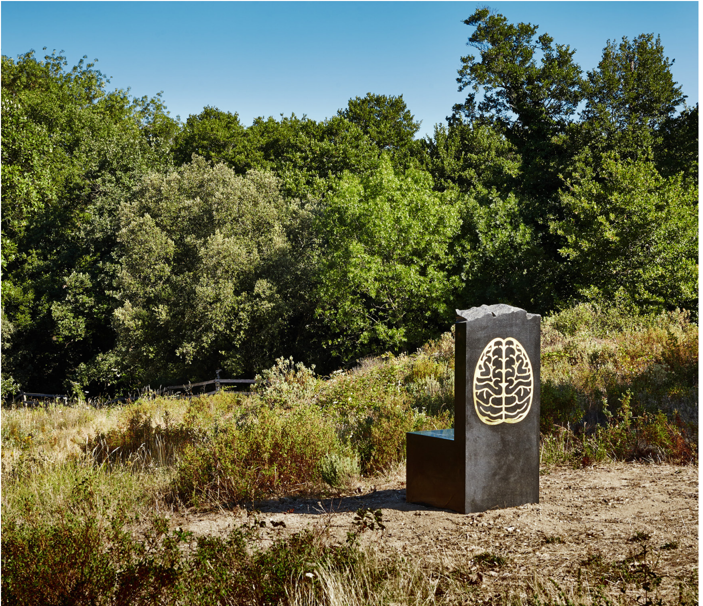
Trône Mesopotamia, 2015

The visitor is invited to sit on Trône Mesopotamia (2015) for a still journey, free from the notion of time. «This sculpture in black granite bears the name, engraved in gold letters, of one of the far away civilisations where we once travelled. Civilisations gave us writing, that is to say they gave us memory and history. Civilisations and populations are today in part destroyed by wars and savagery. »